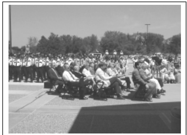
This year's ceremony was well attended by the public and law enforcement personnel.